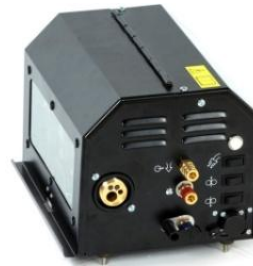
Aristo® RoboFeed (front)