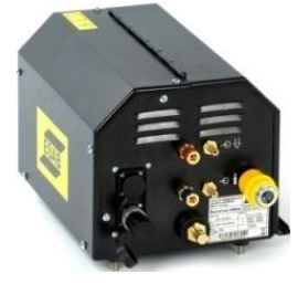
Aristo® RoboFeed (rear)